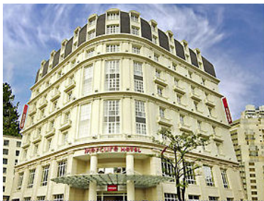
MERCURE HOTEL HANOI

Breakfast in hotel. Free at leisure until till transfer to airport for flight departure home.