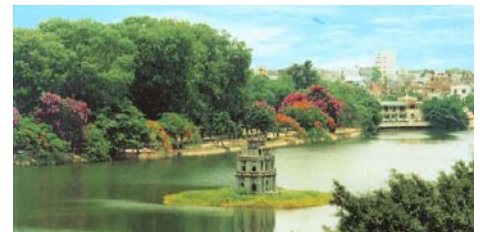
HALONG DREAM HOTEL