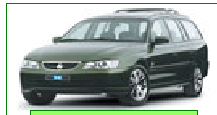
Car Type C