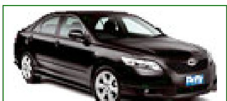
Car Type B