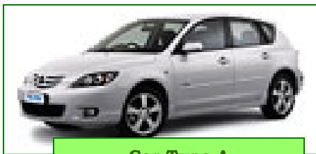
Car Type A

Rates and Tour information's are correct at the time of publishing/printing and are subject to changes without prior notice; please confirm all details at the time of booking. Kindly note that it is the passenger's sole responsibility to Reconfirm & Recheck flight departure times at least three (3) days before departure to ensure flight timings are correct.