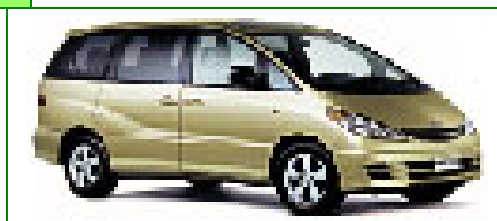
Car Type D