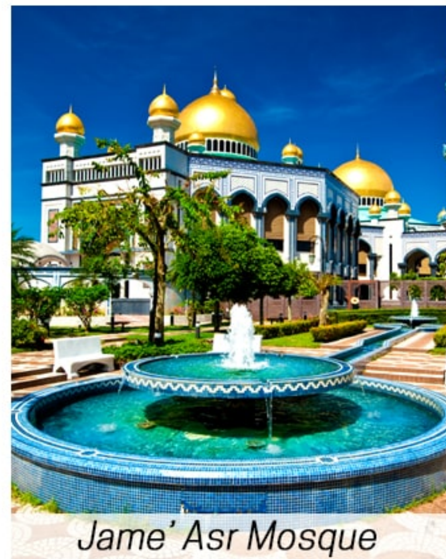
Jame' Asr Mosque