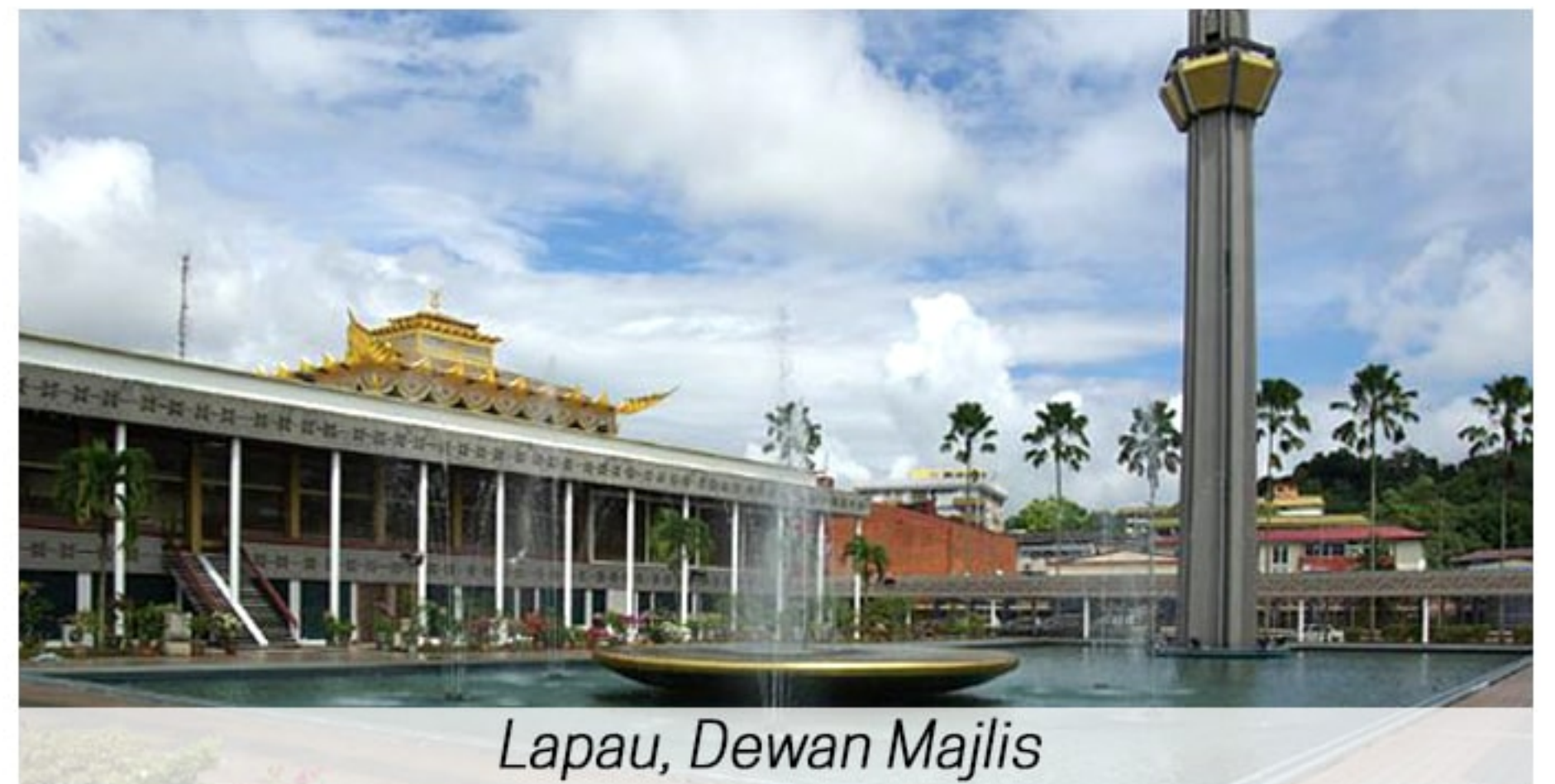
Lapau, Dewan Majlis