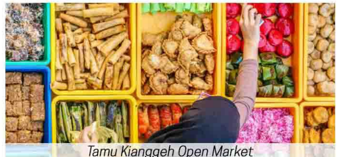
Tamu Kianggeh Open Market