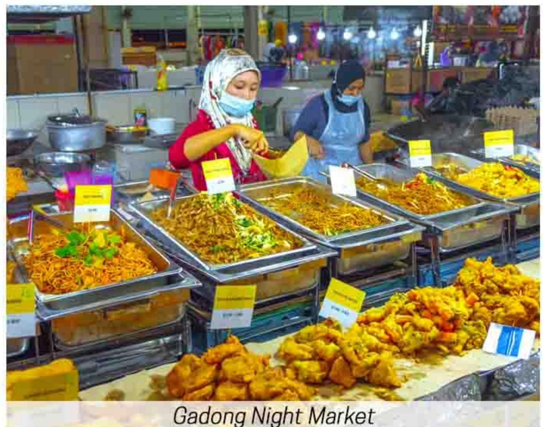
Gadong Night Market