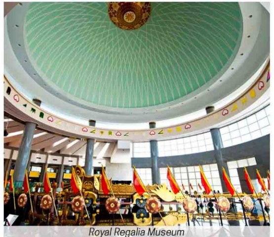
Royal Regalia Museum

TERMS AND CONDITIONS | Freme Travel will make every effort to operate all tours as advertised but we reserve the right to cancel or change when in its best judgement, road conditions, weather, boating schedules or other circumstances deem it to be necessary. In participating in the activities, certain injuries or unfortunate outcomes may arise from the customer's action(s) or inaction(s) or negligence, carelessness or inadvertence or failure to adhere to the rules and instructions of the Travel Agent for the particular activities. The customer assumes all related risks in participation in the activities and therefore waive and release Freme Travel from all claims for any injuries and damages, inconvenience suffered, pecuniary and non-pecuniary losses, any actions or demands of whatsoever arising from Freme Travel or its employees or agent's negligence or inadvertence. The customer confirms that he or she have read the terms herein and understand the legal consequences of releasing Freme Travel from all liability and assuming all risks of participating in the activities. It is the customer's responsibility to ensure that he or she is medically capable of completing the tour and are physically and medically fit to participate in the activities. The customer is not entitled to any refund for any part of the tour that is missed due to sickness, illness or injury or due to other circumstances outside the control of Freme Travel.