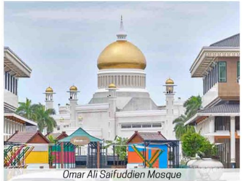
Omar Ali Saifuddien Mosque