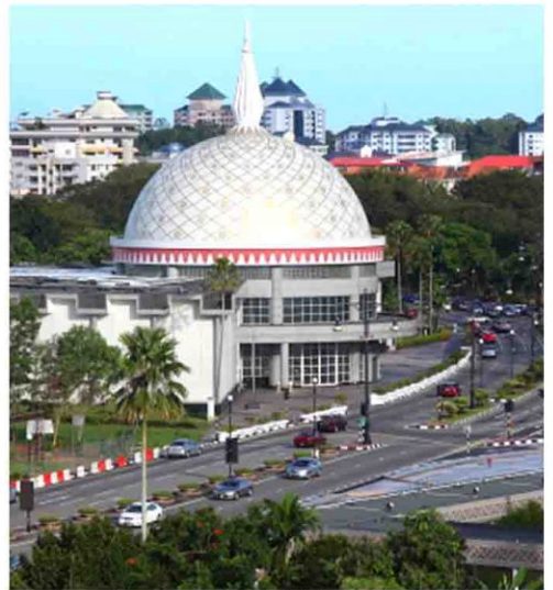
Royal Regalia Museum