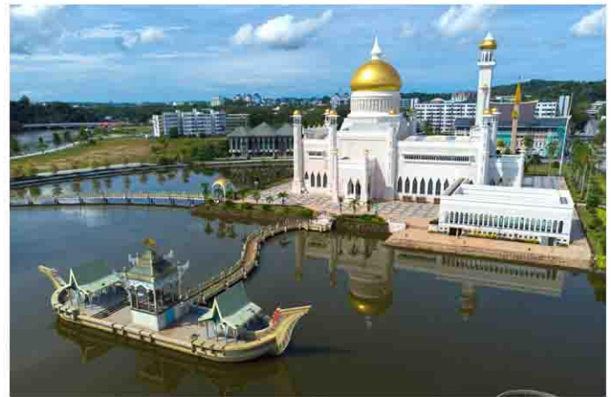
Omar Ali Saifuddien Mosque