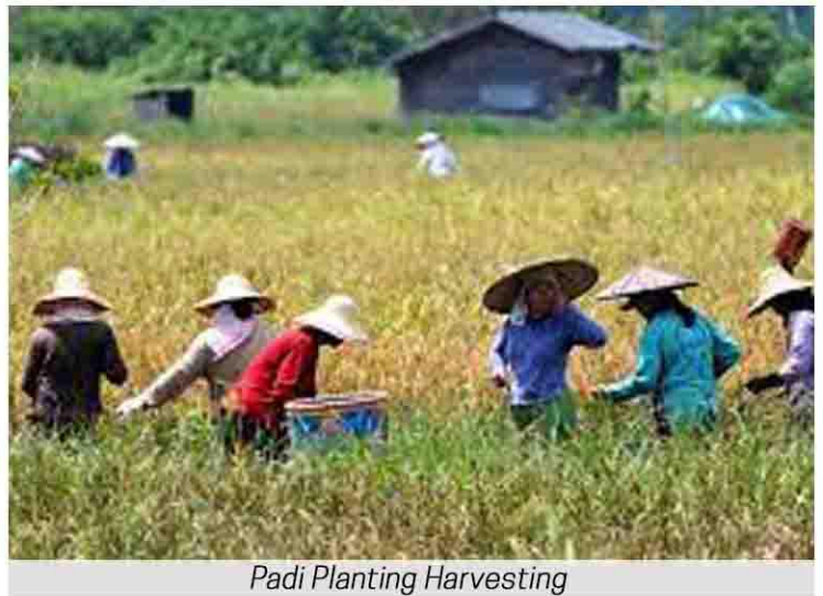
Padi Planting Harvesting