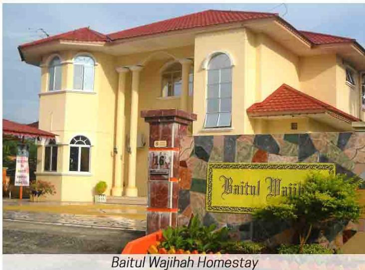
Baitul Wajiah Homestay