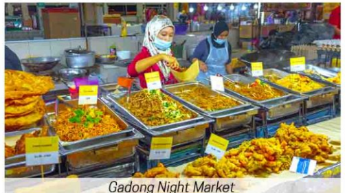
Gadong Night Market