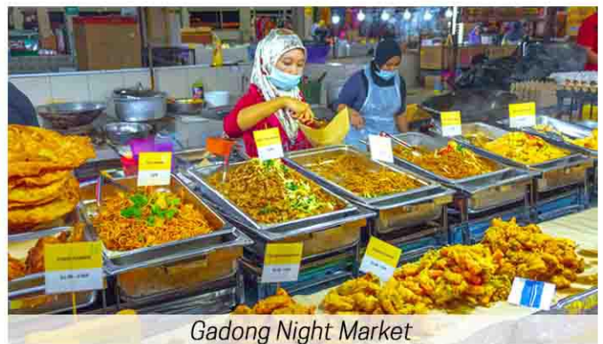
Gadong Night Market